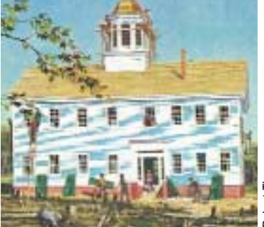
In 1848 a new white frame building was opened in Lansing that became the capitol.

because it had the state university. Marshall was rejected because many people wanted the capital more in the center of the Lower Peninsula. Finally, a landowner offered to give the state twenty acres in Ingham County for the capital. The area was a wilderness with no roads and few people. At first the place was called Michigan. The name was soon changed to Lansing.