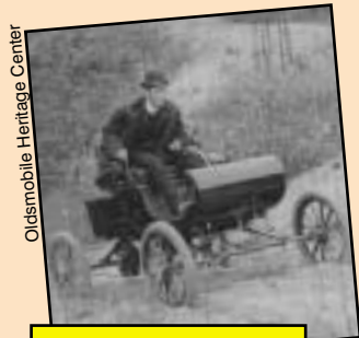
FAST FACT: In 1904 Olds sold 2,500 of his cars for $650 each. In 2000 Oldsmobile sold 266,000 cars with an average price of $22,000 each.